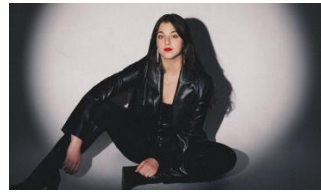
Luxembourg TALI - Fighter